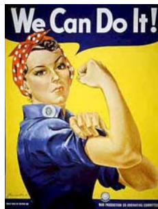
"Rosie the Riveter"

in 1941 and the horrors of the concentration camps at Buchenwald.